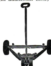
MODEL 3 TRUCK

One-piece steel tube construction with sealed-in ball assembly. Ball stop prevents ball from seating in outlet opening. (Standard on all Bennett Grease Dispensers.)