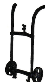
MODEL 2 TRUCK

Sturdy, triangle with two front wheels 3¾" diameter and 1½" face. Rear wheel 8½" diameter and 1½" face. Barrel clamp for locking 30 to 60-gallon drums on truck. Shipping weight approx. 30 lbs.