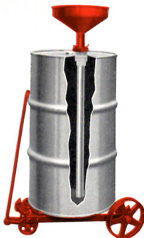
MODEL D-3 OIL DRAIN

NOTE: If Model 2 Truck is desired, specify Model D-2 Oil Drain with Model 2 Truck; if the Bennett Scooter is desired specify Model D-2 Oil Drain with Bennett Scooter.